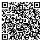
For Plastic Waste Management Details